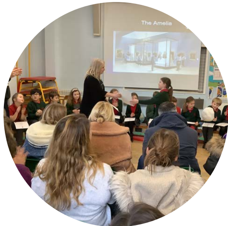
The Amelia Learning Team awarding Year 4 children their Arts Award Discover certificates.

"The children were taken on a journey and immersed in the arts. They reflected on how they use the arts already. They could make own assumptions using first hand evidence and they could apply the skills seen in the work in their own work. The children were proud of their work and this day really fostered a love of the arts."