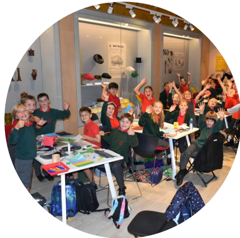
Year 4 Children from Rotherfield Primary enjoying taking part in Discover in a Day at The Amelia.

If you would like to know more about the Arts Award programme, please visit https://www.artsaward.org.uk/ or speak to a member of the Learning Team at the Amelia.